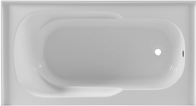
Right Drain Version Shown