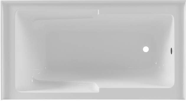
Right Drain Version Shown